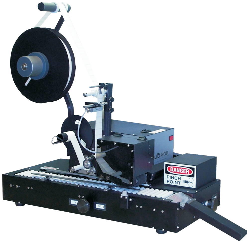
Model 390 Automatic Horizontal Wraparound Label System